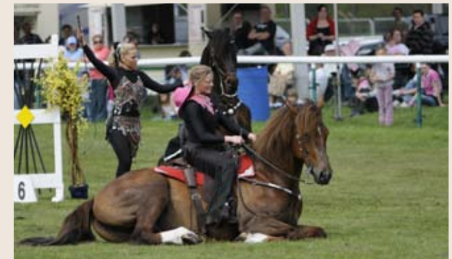
Stallions of Substance