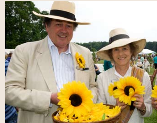
Lord and Lady Cavendish