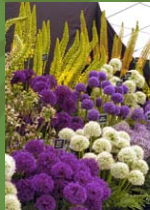
The Horticultural Marquee