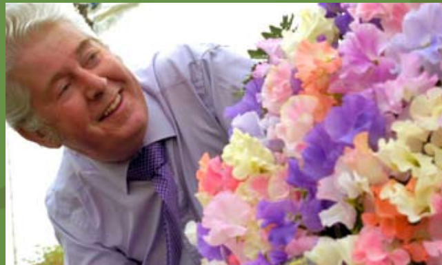
The Horticultural Marquee

The Northern Horticultural Event for 2009