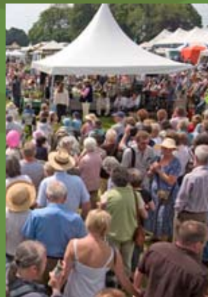
Auction for St Mary's Hospice